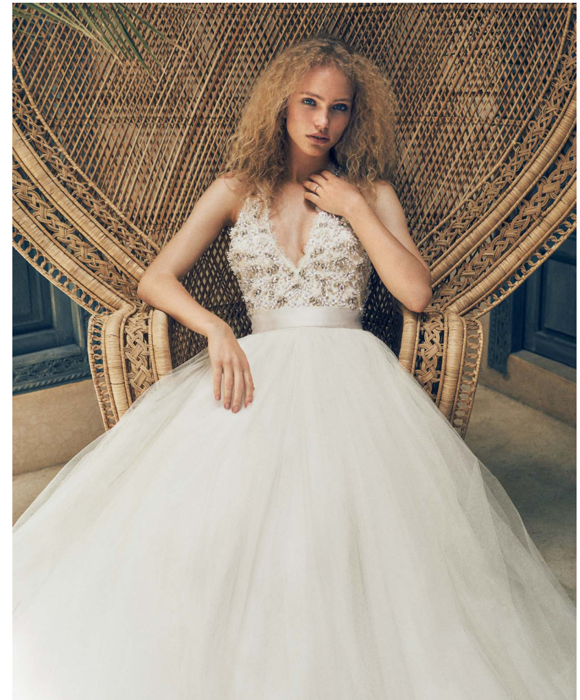
Bride wears Verity pearl and crystal embellished top, Magia tulle skirt and satin belt.

Jenny Packham London 3a Carlos Place, Mount Street London W1K 3AN T: +44 (0)207 493 6295