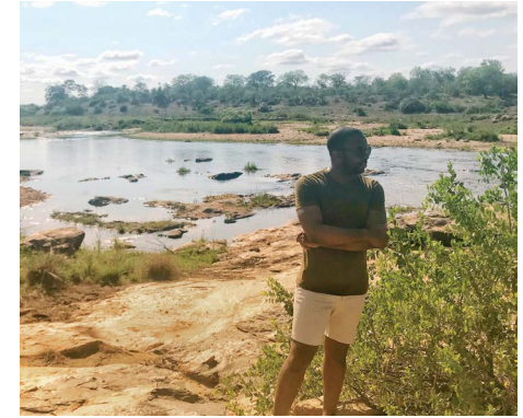
FRANCISCO IN SOUTH AFRICA