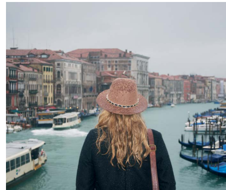
TESSA IN ITALY