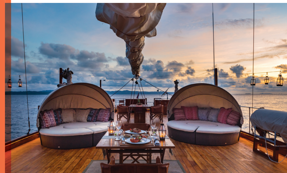
A few steps up to the sky deck delivers stunning views of the tropical paradise.

Corcoran and Sari invested in hiring 12 carpenters who worked eight hours a day for four years to build the vessel.