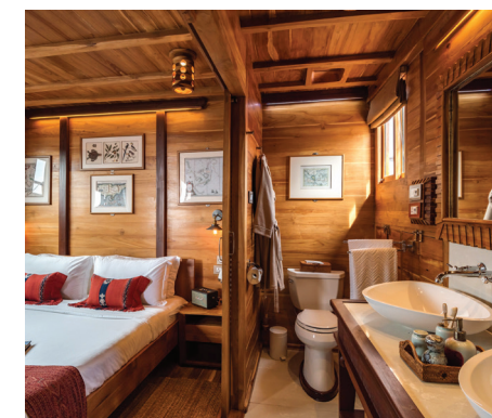
Two deluxe bedrooms feature en-suite bathrooms.

gear, navigation equipment, and other mechanical systems. After a year researching engines, the couple selected a John Deere PowerTech™ 6090AFM85 engine.